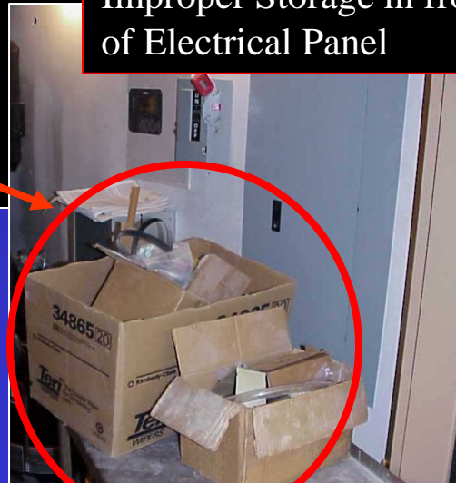
Improper Storage in front of Electrical Panel